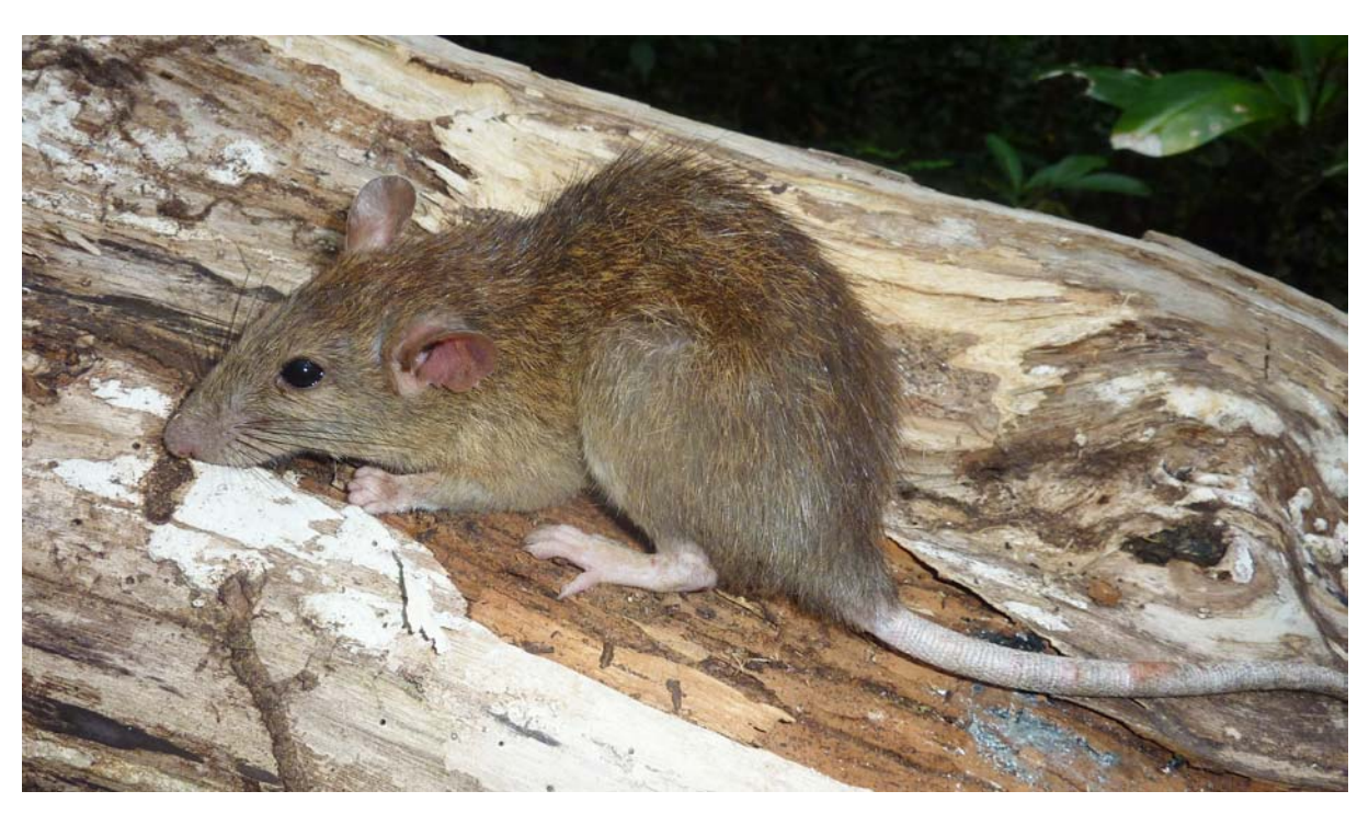
Fig. 5. Germaine rat Rattus germaini.

three cryptic species was shown. According to the COI tree topology, the Con Son specimens belong to the "clade C" which is associated with K. hardwickii s. str., to which specimens from Vietnamese lowland forests also belong.