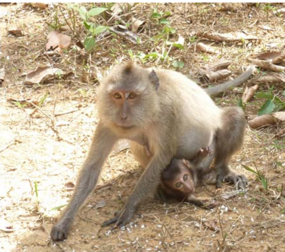
Fig. 8. Crab-eating macaque Macaca fascicularis in So Ray Plantation.