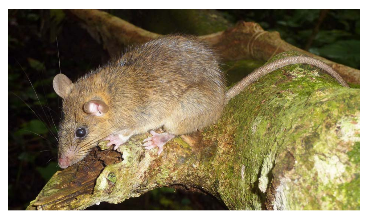
Fig. 6. Indomalayan niviventer Niviventer huang.