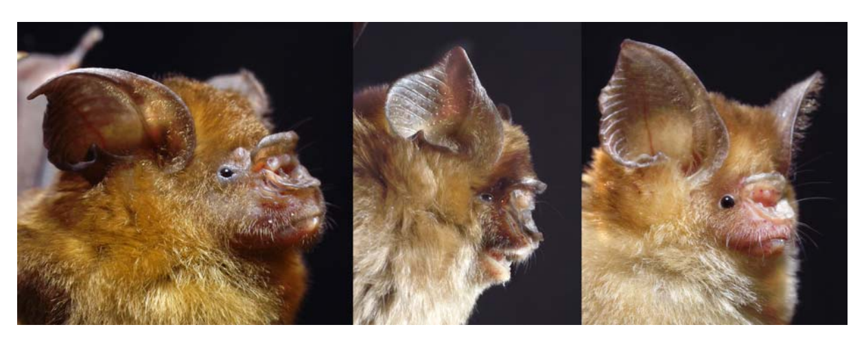
Fig. 3 . Three round-leaf bats occurring on the Con Son Island (left to right): intermediate, Hipposideros grandis ; fawn, H. galeritus ; and least, H. cineraceus .