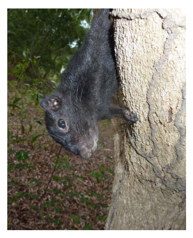
Fig. 7. Finlayson's squirrel Callosciurus finlaysonii.

central part of the country (Dang Ngoc Can et al. , 2008). The species identification of mainland records needs to be confirmed.