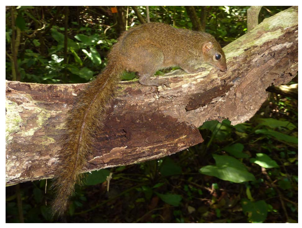
Fig. 2. Northern tree-shrew Tupaia belangeri.

Despite considerable trapping efforts (more than 1200 pitfall trap-days, see Table 1), we collected only one specimen of this species. An adult female was trapped in the vicinity of Nui Chua Mt. (at 205 m a.s.l.). This is large and long-tailed shrew (head and body length 90 mm, tail length 71 mm). The mtDNA analysis suggests that the specimen from the Con Son Island belongs to C. fuliginosa (Abramov et al. , 2012).