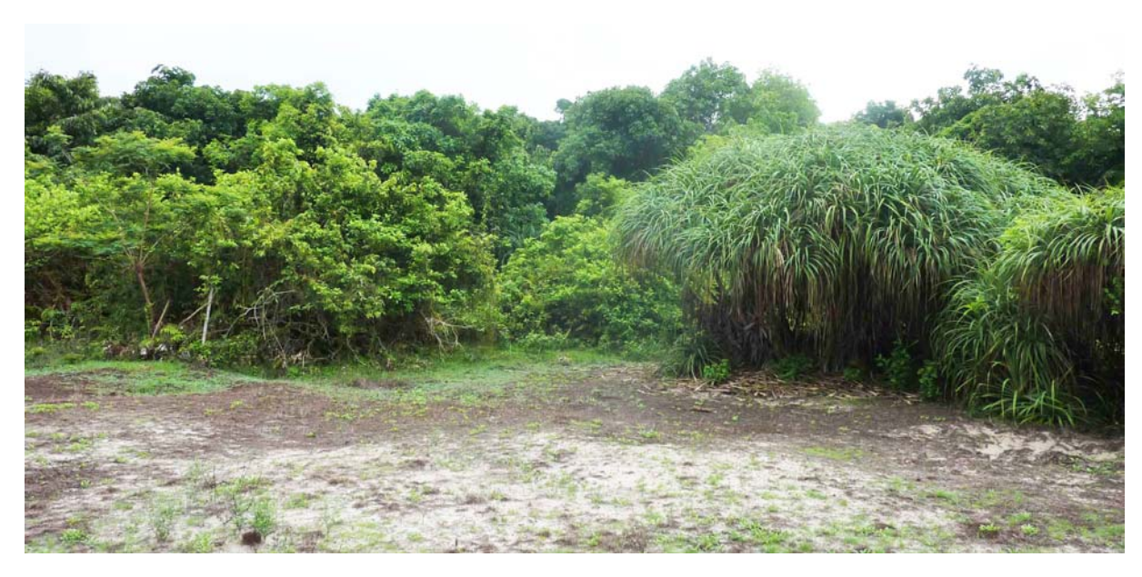
Fig. 9. Bush thickets in northern part of Con Son Island are typical habitats of Burmese hare Lepus peguensis.

Taxonomic remarks. Macaques from the Con Son Island were described as a distinct subspecies M. fascicularis condorensis Kloss, 1926.