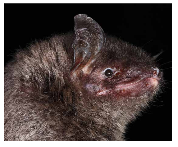
Fig. 7. Myotis chinensis.

During the field survey, an adult male (FA = 66.26 mm, GL = 24.17 mm) was collected (Fig. 7). The animal was captured by a mist net set up across a stream nearby a cave (22.2948° N, 104.9883° E, 664 m a.s.l.) at the late night. To date, the species in northern and central Vietnam has only been recorded from near cave entrances in limestone habitats with the presence of rivers or streams (Bates et al. , 1999, 2001; present paper).