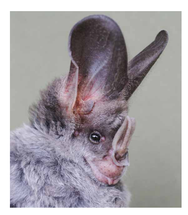
Fig. 6. Lyroderma lyra.

Taxonomic remarks: This species was previously considered within H. pomona . However, it was shown that specimens of H. pomona from the type locality (SW India) and those from the remaining range differ significantly in morphology, and the two forms should be regarded as different species (Srinivasulu & Srinivasulu, 2018). " H. gentilis K. Andersen, 1918" represents the valid name for the second form. Its intraspecies structure is complicated, containing few highly divergent mitochondrial lineages of an uncertain taxonomic status