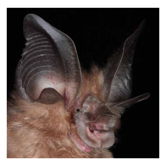
Fig. 4. Rhinolophus rex.