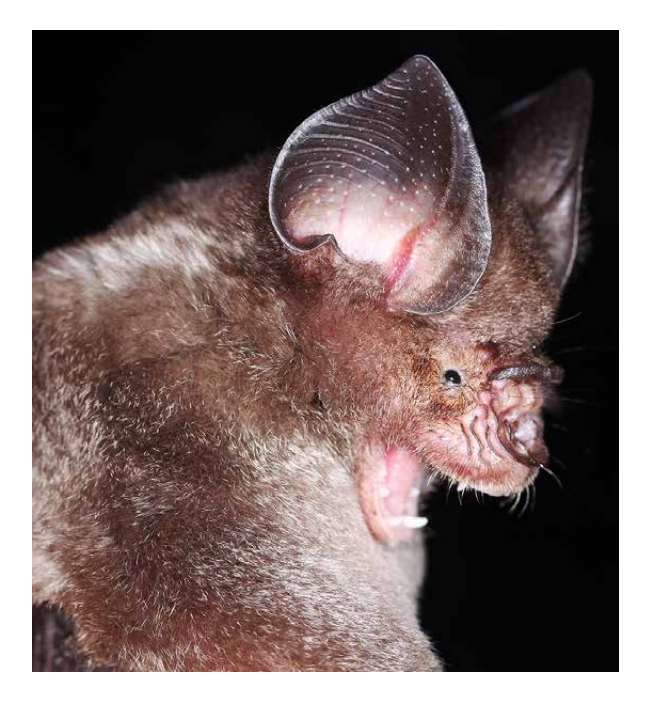
Fig. 5. Hipposideros cf. larvatus .

Thirty-five individuals of this medium-size leafnosed bat were captured (FA = 55.10-61.50 mm, GL = 21.91-23.39 mm), composing about 28.7% of all bats captures during the field work in both sites. These bats were observed in larger limestone caves with high ceilings. The colony in the Bac Me NR was estimated to be 100-200 individuals. They concentrated in small groups in different positions and co-occupied the cave with other species, including H. armiger , A. dongb acanus and H. gentilis . This species alongside with A. dongbacanus was found to be the most abundant bat in this area, occurring almost in all studied habitats. Some collected males captured in the Bac Me NR in October possessed a well-developed frontal gland behind the posterior noseleaf (Fig. 5).