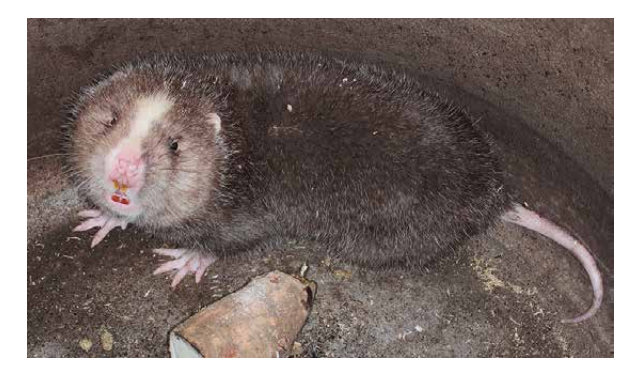
Fig. 8. Rhizomys pruinosus from the Cham Chu NR.

C. thomasi was suggested to occur from north-western (Son La, Lao Cai Provinces) to central Vietnam (Kon Tum and Nghe An Provinces) (Balakirev et al. , 2014).