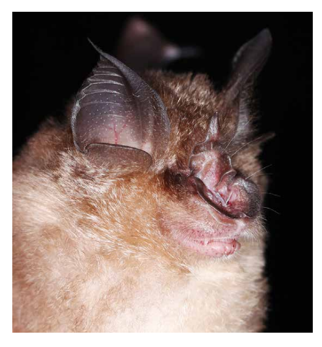
Fig. 3. Rhinolophus microglobosus .

at a cave's entrance near the Bac Me NR (Fig. 3). The colony size was estimated to be about 35–40 individuals.