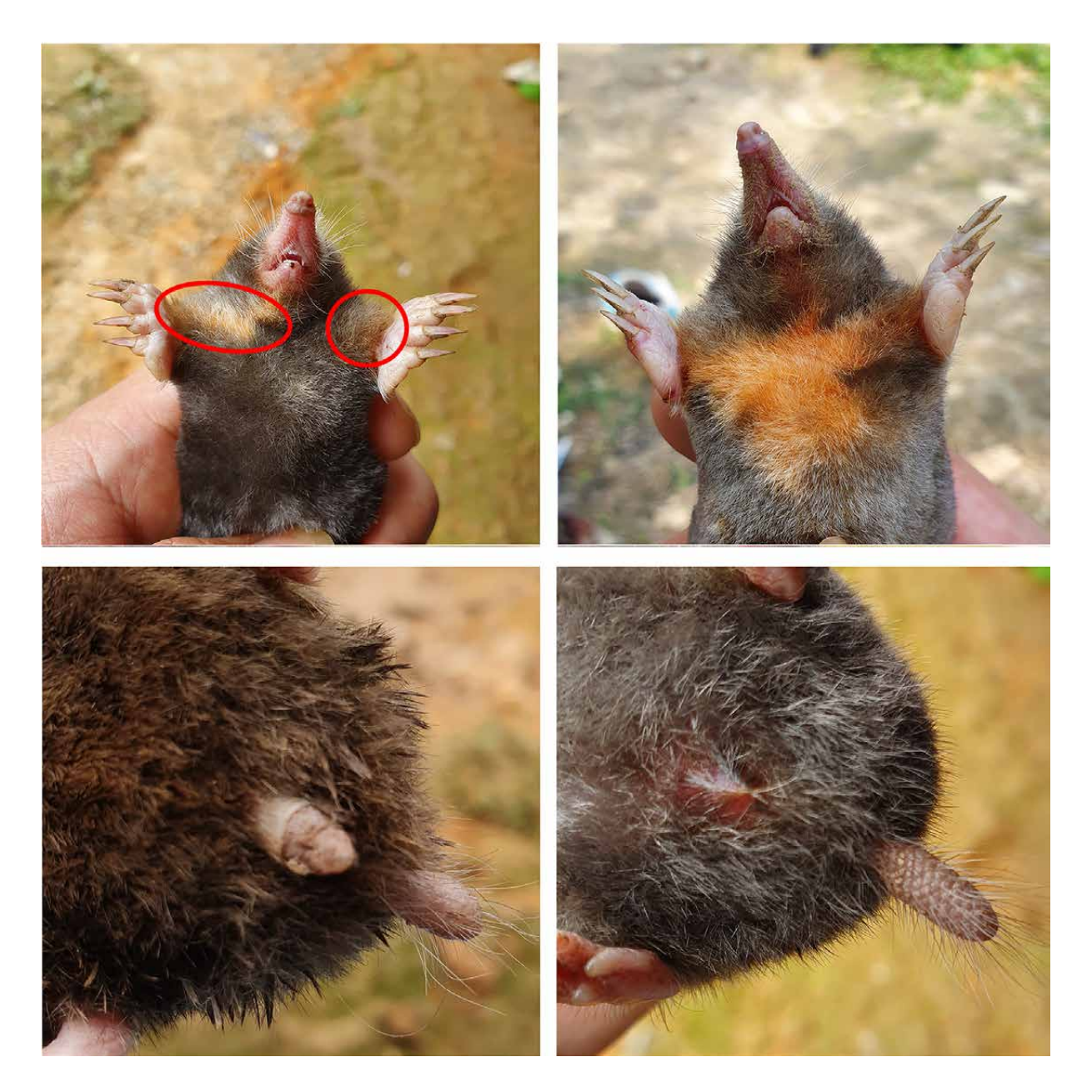
Fig. 2. Coloration of neck and adjacent forearms, and tail shape of two specimens of Euroscaptor cf. orlovi from the Cham Chu NR.

forest. In Vietnam, M. minimus has been recorded from two localities in southern Vietnam only, while M. sobrinus has been documented from all the northern, central and southern regions of the country. In Vietnam, the two species are distinguishable by the size, nostril shape and mandible symphyse (Kruskop, 2013; Hoang Trung Thanh et al. , 2019), but are indistinguishable by their mitochondrial DNA (Francis et al. , 2010; Abramov et al. , 2018), probably due to an ancient interbreed event.