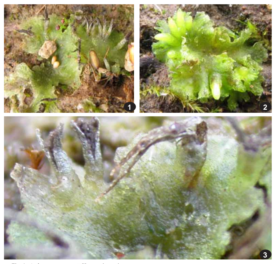
Fig. 1. Anthoceros macounii Howe, photos in nature.

Distribution : eastern North America and Japan (Schuster, 1992; Hasegawa 1984).