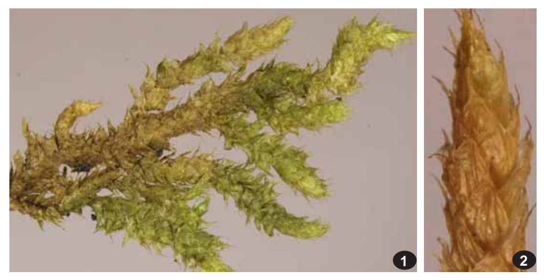
Fig. 1. Rhytidiadelphus japonicus var. kamchaticus var. nov. (from holotype, LE): 1 - habit, dry; 2 - habit, wet.

cations. Resulting ITS and trn L-F trees are shown in Fig. 3. A relatively high jackknife support (82) indicates phylogenetic relationship of Kamchatka plants with the specimen of R. japonicus from the Kuril Islands, although another GenBank sequence of the latter species (without specimen data) shows close relationship to R. subpinna tum–squarrosum group and likely belongs to it, although we failed to find a chance to check this. This specimen is given in parenthesis in ITS tree.