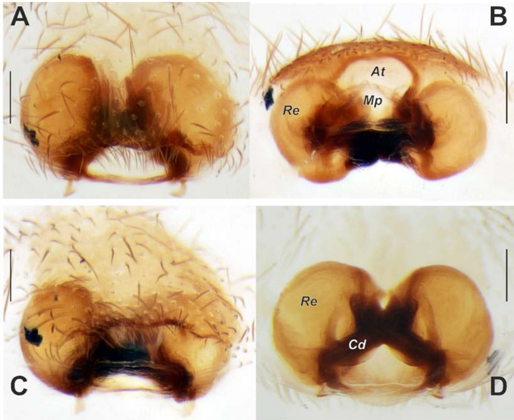
Fig. 3. Macerated epigyne of Cedicoides pavlovskiy . A — ventral; B — caudal; C — ventro-caudal; D — dorsal. Abbreviations: Ar — arch of anterior foveal margin; At — atrium; Cd — copulatory duct; Mp — median plate; Re — receptacle. Scale bars — 0.2 mm.

Рис. 3. Мацерированная эпигина Cedicoides pavlovskiy . А — снизу; В — сзади; С — снизу-сзади; D — сверху. Сокращения: Ar — дуга переднего края ямки; At — атриум; Cd — канал семяприемника; Mp — срединная пластинка; Re — рецептакула. Масштаб 0,2 мм.