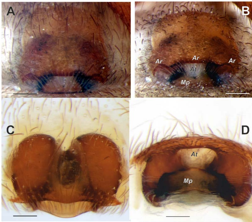
Fig. 2. Epigyne of Cedicooides pavlovskiyi . A, B — intact, ventral and ventro-caudal; C, D — dissected, ventral and caudal. Abbreviations: Ar — arch of anterior foveal margin; At — atrium; Mp — median plate. Scale bars — 0.2 mm.

Рис. 2. Эпигина Cedicooides pavlovskiyi . A, B — не рассеченная, снизу и снизу-сзади; C, D — отделенная, снизу и сзади. Сокращения: Ar — дуга переднего края ямки; At — атриум; Mp — срединная пластинка. Масштаб 0,2 мм.