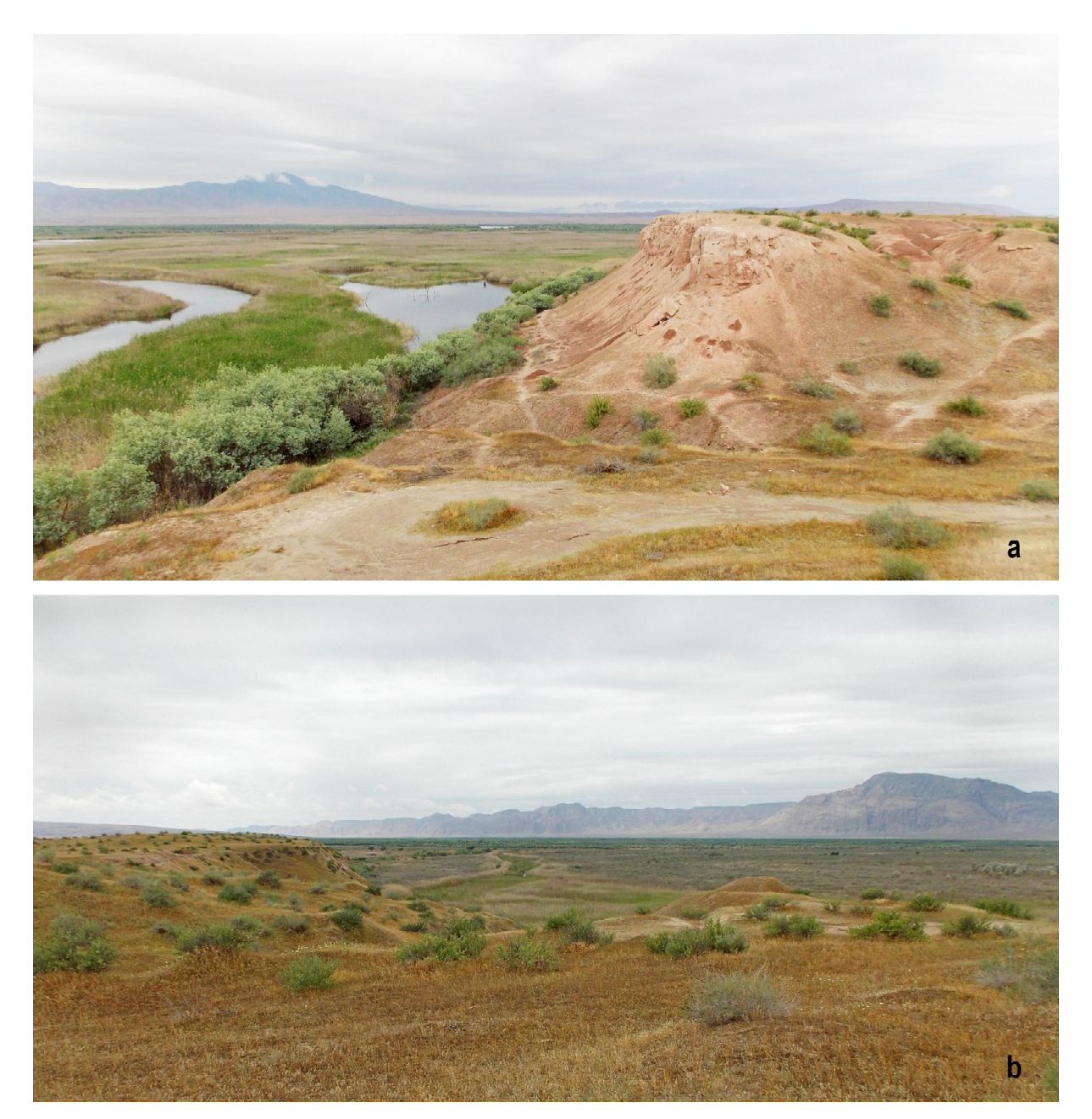
Fig. 2. The localities of concentration of A. parthenope during spring in the desert part of Nature reserve «Tigrovaya Balka» (loc. 1). a — floodplain terrace on the border between desert and riparian areas; b — semi-fixed sands with shrub vegetation ( Salsola and Tamarix ).

Рис. 2. Места концентрации А. parthenope в весенний период в пустынной зоне заповедника «Тигровая Балка» (loc. 1). а — пойменная терраса на границе между пустынной и тугайной зонами; b — полузакреплённые пески с кустарниковой растительностью ( Salsola and Tamarix ).