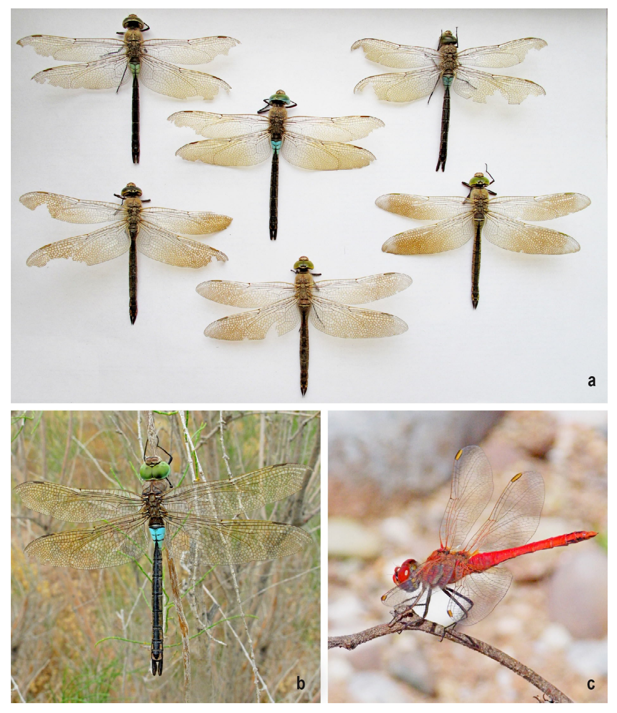
Fig. 4. Migratory dragonflies. a — «old» individuals of A. parthenope collected in the desert part of Nature reserve «Tigrovaya Balka» (loc. 1, 4); b — «old» male of A. Parthenope (loc. 4); c — mature male of S. fonscolombii (loc. 13). Рис. 4. Стрекозы-иммигранты. а — «старые» особи А. parthenope , собранные в пустынной части заповедника «Тигровая

Рис. 4. Стрекозы-иммигранты. а — «старые» осоой А. рагіпепоре , сооранные в пустынной части заповедника «тигровая Балка» (loc. 1, 4); b — «старый» самец А. parthenope (loc. 4); с — половозрелый самец S. fonscolombii (loc. 13).