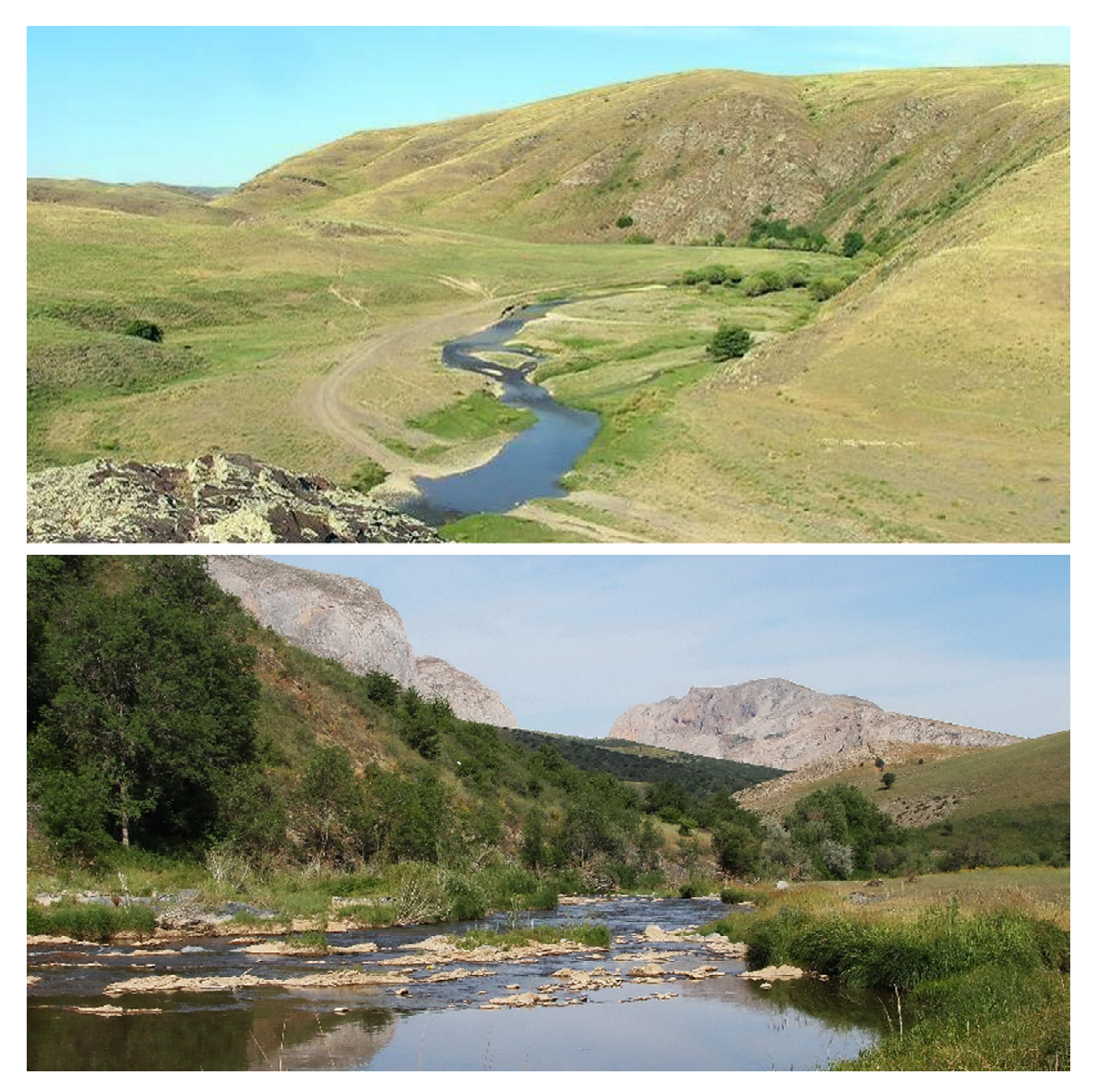
Fig. 2. Syrdarya Karatau Range, Koshkarata River (Loc. 11) (above) and Boroldai River (Loc. 10) (below). Рис. 2. Хребет Сырдарьинский Каратау, река Кошкарата (Loc. 11) (вверху) и река Боролдай (Loc. 10) (внизу).