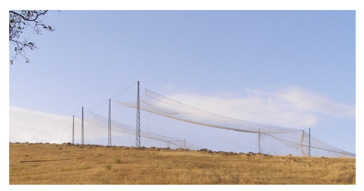
Fig. 9. Ornitological traps at Chokpak Pass (autumn station). Рис. 9. Орнитологические ловушки на перевале Чокпак (осенний стационар).

flight speed) [Srygley, Dudley 2008; Chapman et al. 2015].