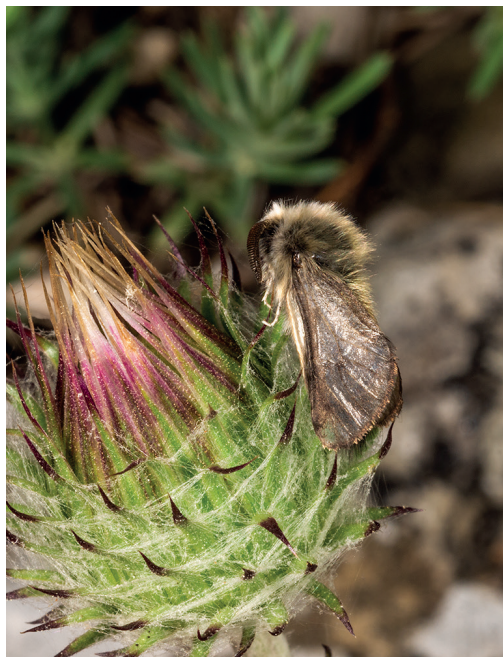
Fig. 5. Male of Stygioides colchicus (Herrich-Schäffer, 1851). Ukraine, Crimea, Staryy Krym, Agarmysh Mt., 45°02'N, 35°04'E, 500 m, 9.V.2012, O. Gorbunov leg. Рис. 5. Самец Stygioides colchicus (Herrich-Schäffer, 1851). Украина, Крым, Старый Крым, гора Агармыш, 45°02' с.ш., 35°04' в.д., 500 м, 9.V.2012, О. Горбунов.

Moscow, Russia (CAZM); the collection of K.A. Efetov, Simferopol, Russia (CKES); the collection of A.N. Severtsov Institute of Ecology and Evolution of the Russian Academy of Sciences, Moscow, Russia (COGM); the collection of R.V. Yakovlev, Barnaul, Russia (CRYB); the collection of the Institute of Zoology, Russian Academy of Sciences, Sankt Petersburg, Russia (ZISP); Museum für Naturkunde, Leibniz-Institut für Evolutions- und Biodiversitätsforschung, Berlin, Germany (ZMHB).