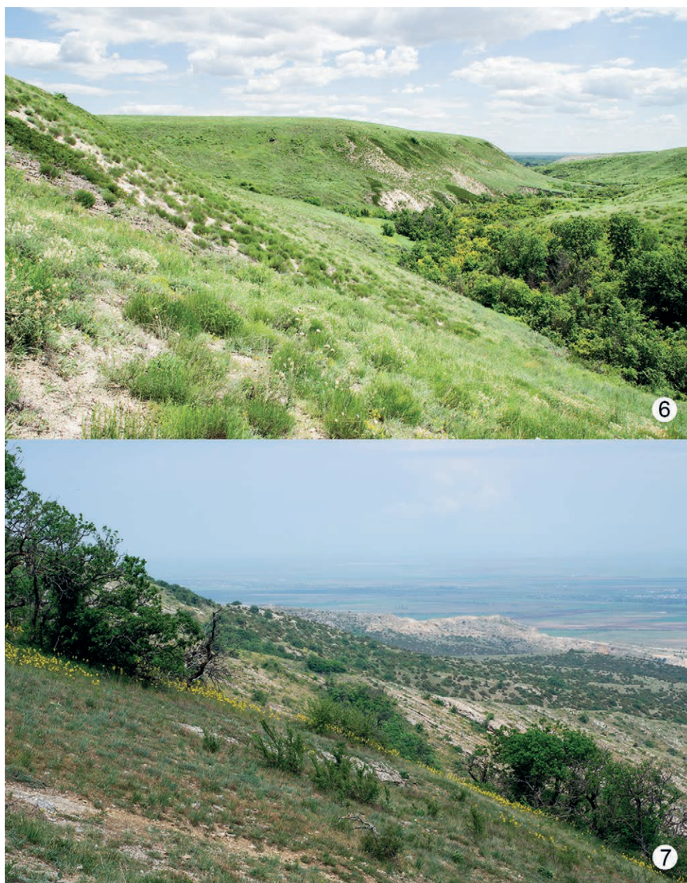
Figs 6–7. Habitats of Stygioides colchicus (Herrich-Schäffer, 1851): 6 — Russia, Volgograd Region, Ol'khovka District, Mikhaylovka, 49°47'N, 44°24'E, 2.VI.2015; 7 — Russia, Crimea, Staryy Krym, Agarmysh Mt., 45°02.27'N, 35°03.20'E, 685 m, 9.VI.2017.

Рис. 6–7. Биотопы Stygioides colchicus (Herrich-Schäffer, 1851): 6 — Россия, Волгоградская область, Ольховский район, Михайловка, 49°47' с.ш., 44°24' в.д., 2.VI.2015; 7 — Россия, Крым, Старый Крым, гора Агармыш, 45°02.27' с.ш., 35°03.20' в.д., 685 м, 9.VI.2017.