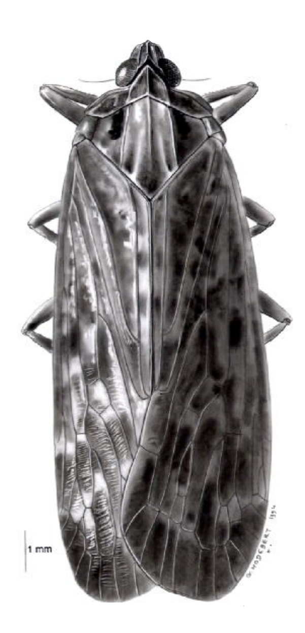
Fig. 1. Emeljanocarinus gargantua gen. et sp.n., habitus. Рис. 1. Emeljanocarinus gargantua gen. et sp.n., внешний вид.

and Acocarinus , for wich only females were known. The following new taxa is also described only from females. However male are now known for the other Mycarini taxa and will described in the Achilidae Fauna of Madagascar in preparation.