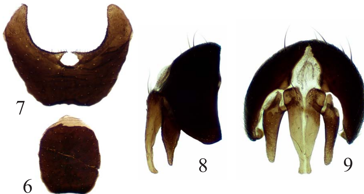
Figs 6–9. Scathophaga infumatum (Becker), HT ♂: 6 — sternite 4; 7 — sternite 5; 8 — epandrium, cercus and surstylus, dorsal view; 9 — epandrium, cercus and surstylus, lateral view.

Рис. 6–9. Scathophaga infumatum (Becker), HT ♂: 6 — стернит 4; 7 — стернит 5; 8 — эпандрий, церки и сурстили, сверху; 9 — эпандрий, церк и сурстиль, сбоку.