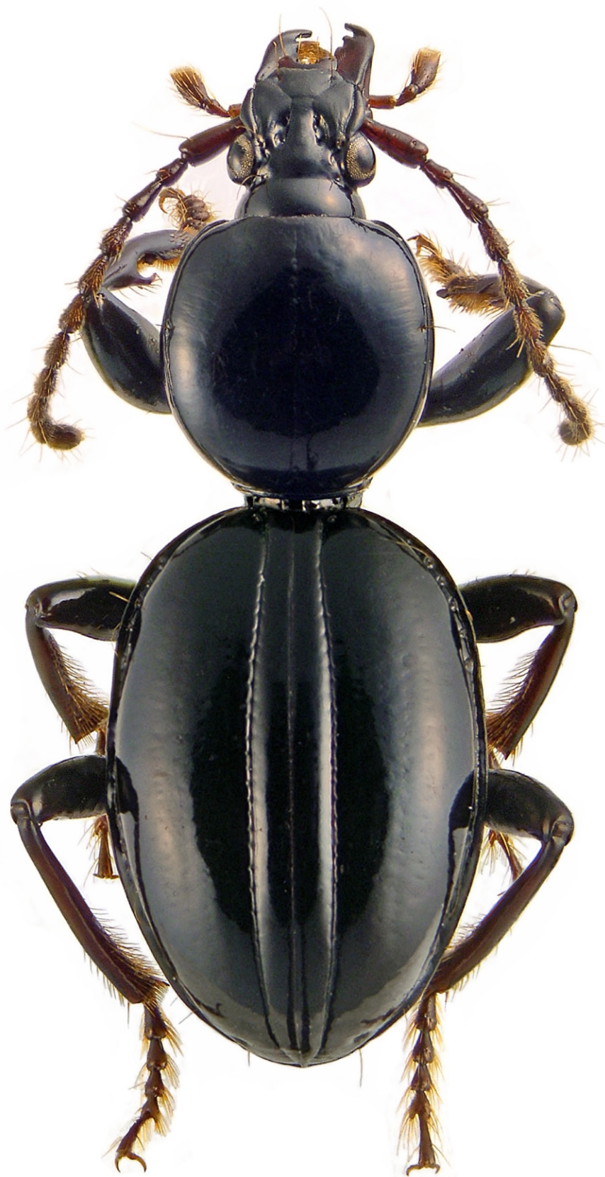
Fig. 1. Dyschiridium belovi sp.n., dorsal habitus. Рис. 1. Dyschiridium belovi sp.n., общий вид.