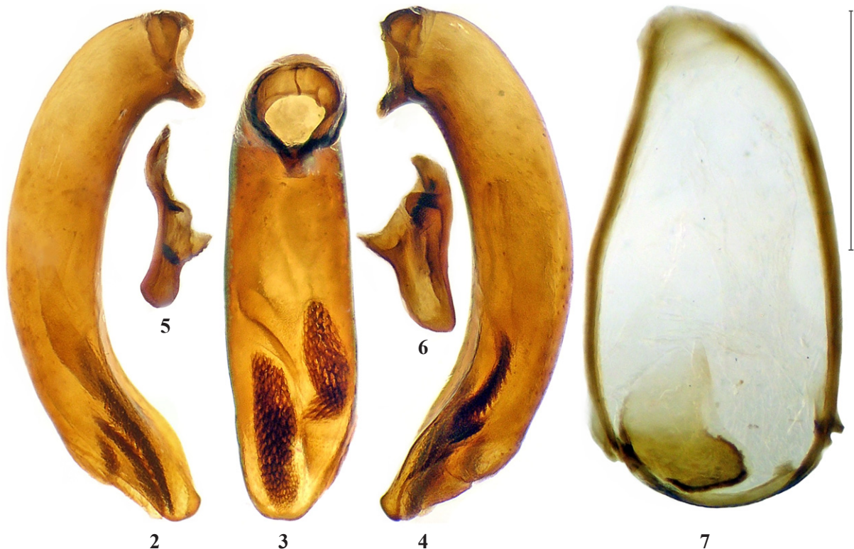
Figs 2–7. Dyschiridium belovi sp.n., male: 2–4 — penis; 5 — right paramere; 6 — left paramere; 7 — tergite IX; 2 — right lateral view; 3 — ventral view; 4 — left lateral view; 7 — dorsal view. Scale bar 1 mm.

Trochanters with a seta; pro-, meso- and metacoxa uni-, bi- and trisetose, respectively; profemur with a medial seta ventrally and another one at base of posterior surface; mesofemur at anteroventral edge with a submedial seta hardly