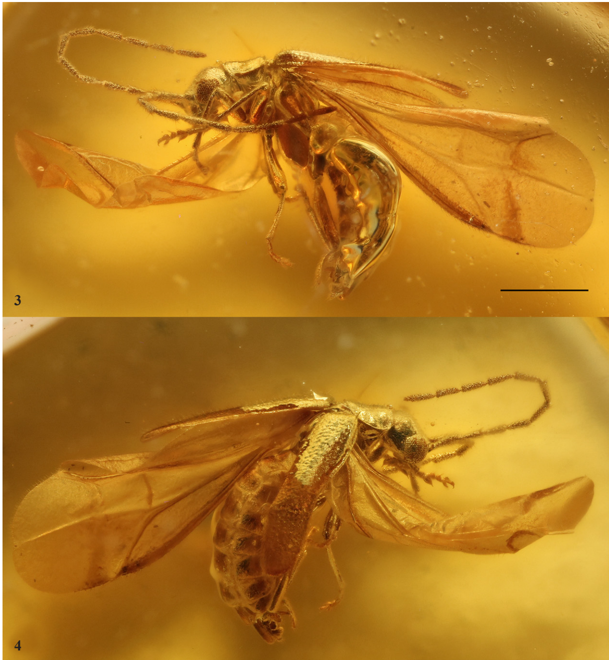
Figs 3–4. General view of Malthodes rovnoensis sp.n., holotype male: 3 — laterally, left side; 4 — laterally, right side. Scale bar: 1 mm.

Рис. 3–4. Общий вид Malthodes rovnoensis sp.n., голотип, самец: 1 — слева; 2 — справа. Масштаб: 1 мм.