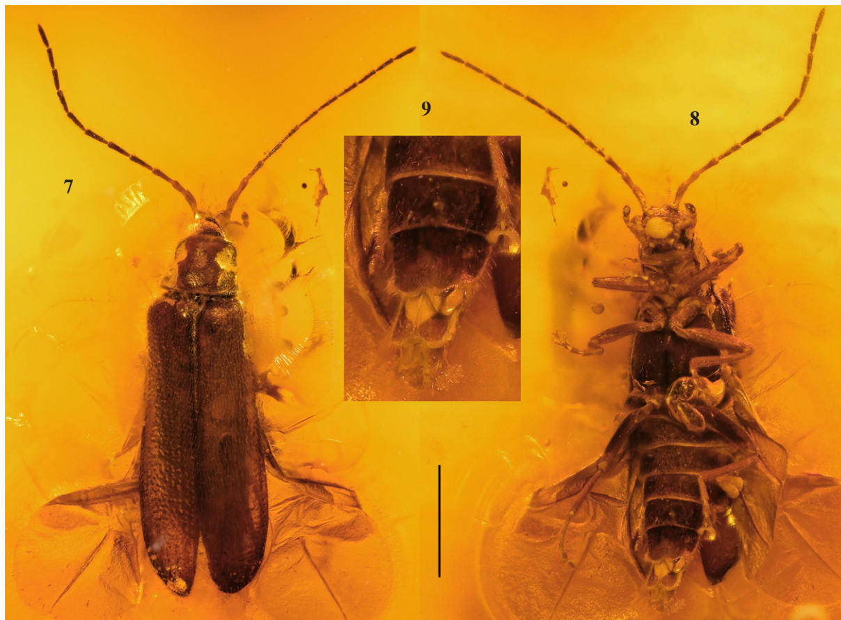
Figs 7–9. Details of Mimoplatycis notha , male: 7 — general view, dorsally; 8 — same, ventrally; 9 — terminal abdominal segments, ventrally. Scale bar (for Figs 7–8): 1 mm.

Рис. 7–9. Детали строения Mimoplatycis notha , самец: 7 — общий вид, сверху; 8 — то же, снизу; 9 — верхние сегменты брюшка, снизу. Масштаб (для рис. 7–8): 1 мм.