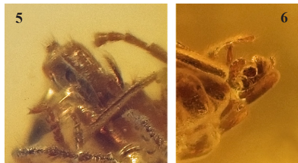
Figs 5–6. Terminal abdominal segments of Malthodes rovnoensis sp.n., holotype male: 5 — ventrally; 6 — laterally.

sucini Kuška et Kania, 2010: 55. Baltic amber. Late Eocene.