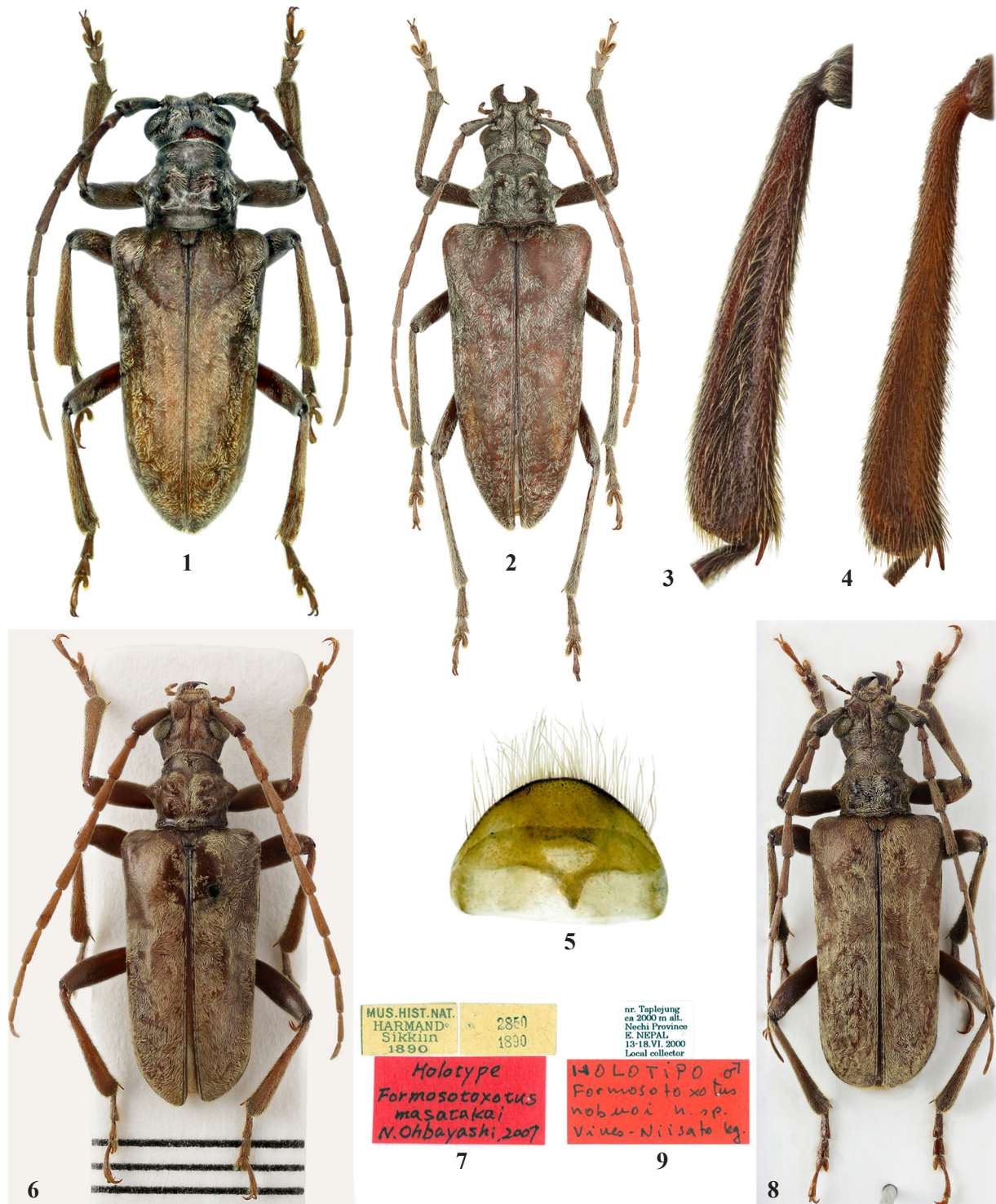
Figs 1-9. Formosotoxotus spp.: 1-3, 5 — F. gressitti sp.n.; 4, 6-7 — F. masatakai ; 8-9 — F. nobuoi ; 1, 3-6, 8 — holotypes males; 2 — paratype female; 3-4 — left metatibia, inner view; 5 — tergite 8, dorsal view; 7, 9 — labels of the holotype.

COMPARATIVE MATERIAL. Formosotoxotus masatakai N. Ohbayashi, 2007: holotype ♂ (Fig. 6) (MNHN), "Mus.Hist.Nat., Harmand, Sikkim, 1890", "Holotype Formosotoxotus masatakai N. Ohbayashi, 2007" (Fig. 7); Formosotoxotus nobuoi Vives et Niisato,