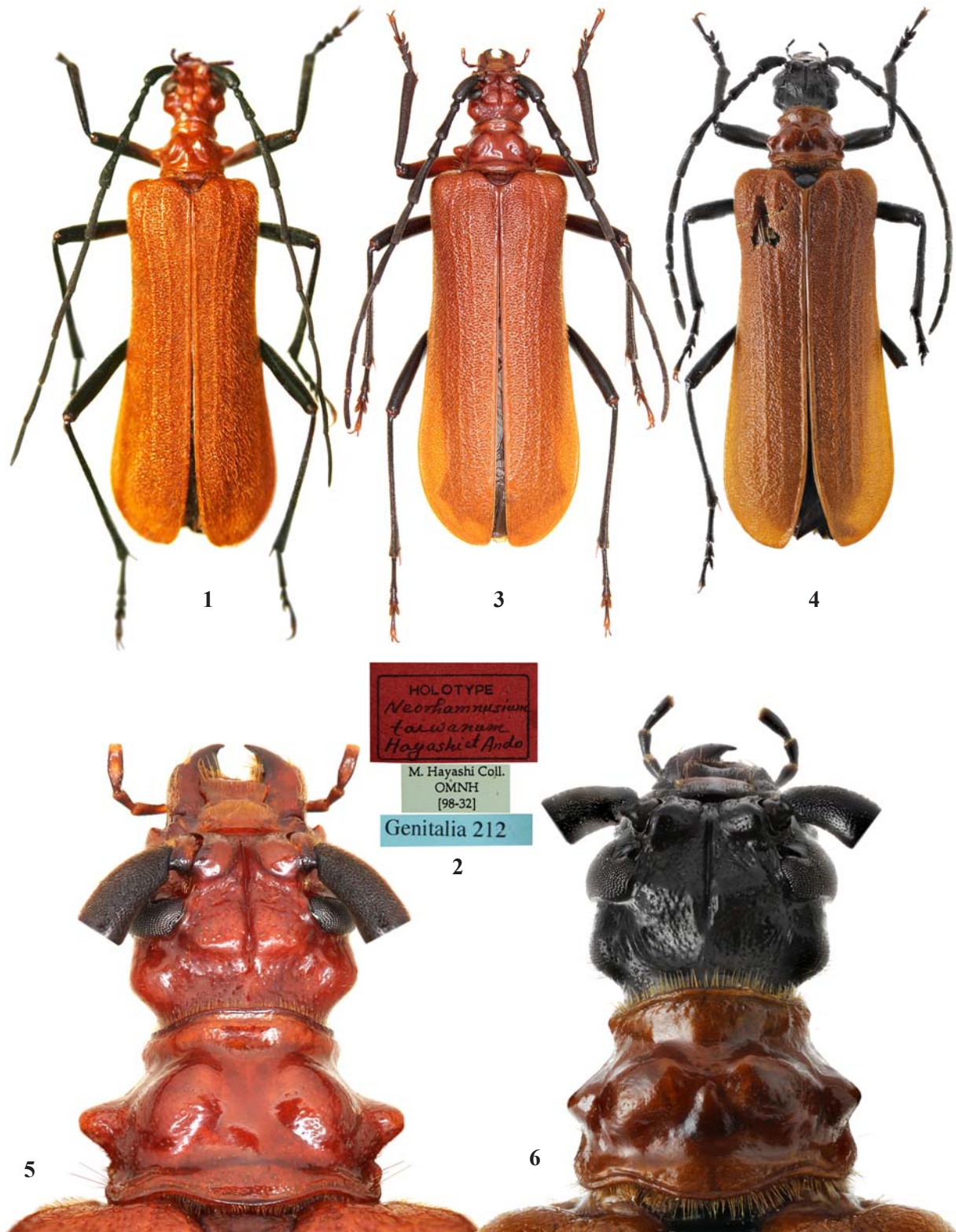
Figs 1–6. Neorhamnusium spp.: 1–3, 5 — N. taiwanum ; 4, 6 — N. melanocephalum sp.n.; 1, 3, 4 — habitus; 2 — labels of the holotype; 5, 6 — head and pronotum, dorsal view; 1 — holotype male; 3, 5 — female; 4, 6 — holotype female (1, 3, 5 — photographs by Nobuo Ohbayashi; 2 — photograph by Shigehiko Shiyake).