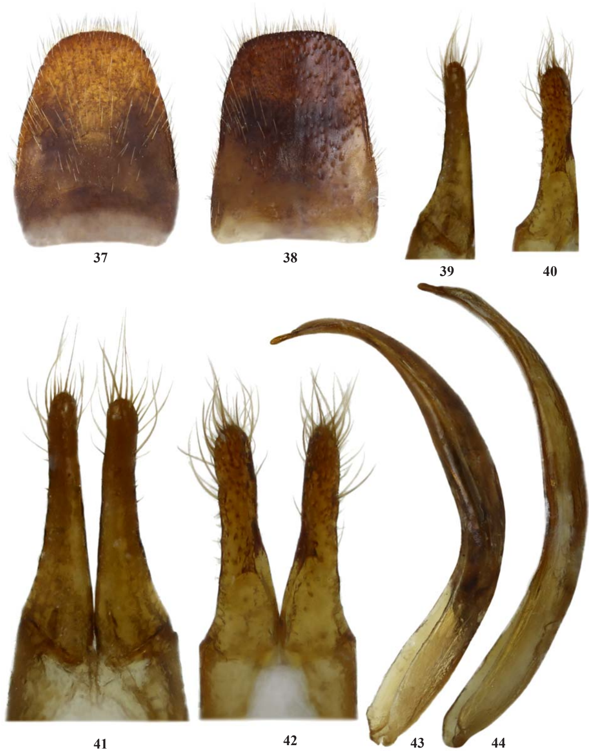
Figs 37–44. Neorhamnusium ssp., holotypes, males, genitalia: 37, 39, 41, 43 — N. rugosipenne ; 38, 40, 42, 44 — N. shaanxiensis sp.n.; 37–38 — tergite 8, dorsal view; 39–40 — left paramere, dorsal view; 41–42 — apical part of the tegmen, dorsal view; 43–44 — penis, lateral view.

Рис. 37–44. Neorhamnusium ssp., голотипы, самцы, гениталии: 37, 39, 41, 43 — N. rugosipenne ; 38, 40, 42, 44 — N. shaanxiensis sp.n.; 37–38 — 8-й тергит сверху; 39–40 — левая параметра сверху; 41–42 — верхняя часть тегмена сверху; 43–44 — пенис сбоку.