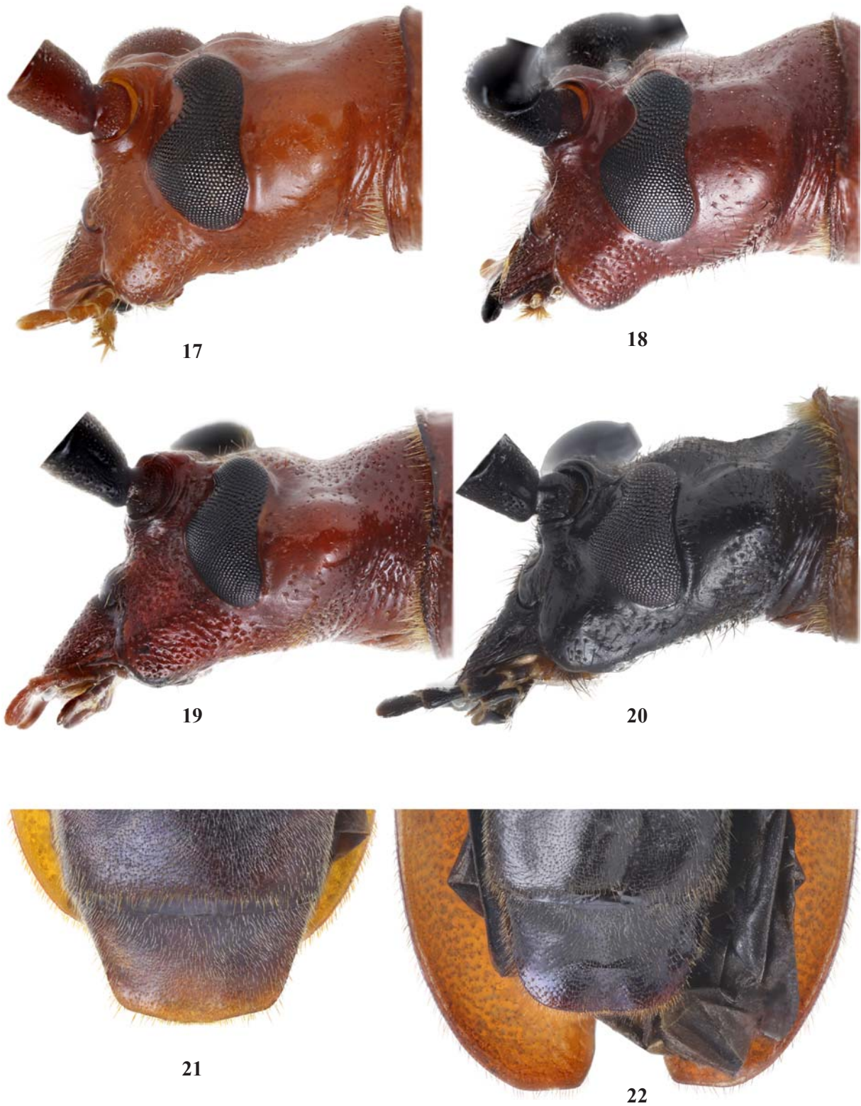
Figs 17–22. Neorhamnusium ssp., holotypes: 17, 21 — N. rugosipenne ; 18, 22 — N. shaanxiensis sp.n.; 19 — N. wuchaoi sp.n.; 20 — N. melanocephalum sp.n.; 17–20 — head, lateral view; 21 — apex of the abdomen, ventral view; 22 — apices of the abdomen and elytra, ventral view; 17–18, 21–22 — males; 19–20 — females.

Рис. 17–22. Neorhamnusium ssp., голотипы: 17, 21 — N. rugosipenne ; 18, 22 — N. shaanxiensis sp.n.; 19 — N. wuchaoi sp.n.; 20 — N. melanocephalum sp.n.; 17–20 — голова сбоку; 21 — вершина брюшка снизу; 22 — вершины брюшка и надкрылий снизу; 17–18, 21–22 — самцы; 19–20 — самки.