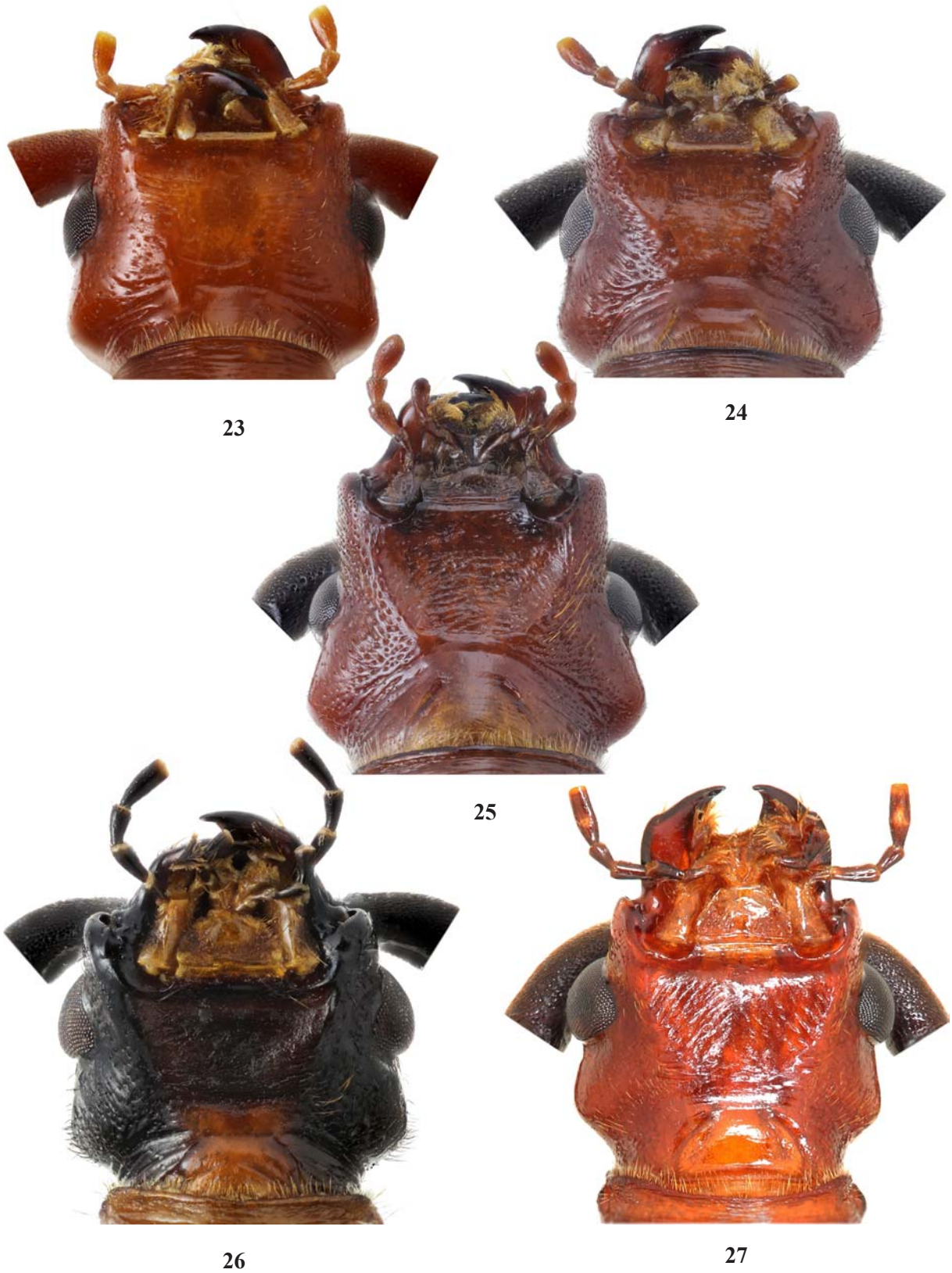
Figs 23–27. Neorhamnusium ssp., head, ventral view: 23 — N. rugosipenne ; 24 — N. shaanxiensis sp.n.; 25 — N. wuchaoi sp.n.; 26 — N. melanocephalum sp.n.; 27 — N. taiwanum; 23–26 — holotypes; 23, 24 — males; 25–27 — females. Рис. 23–27. Neorhamnusium ssp., голова снизу: 23 — N. rugosipenne ; 24 — N. shaanxiensis sp.n.; 25 — N. wuchaoi sp.n.; 26 — N. melanocephalum sp.n.; 27 — N. taiwanum; 23–26 — голотипы; 23, 24 — самцы; 25–27 — самки.