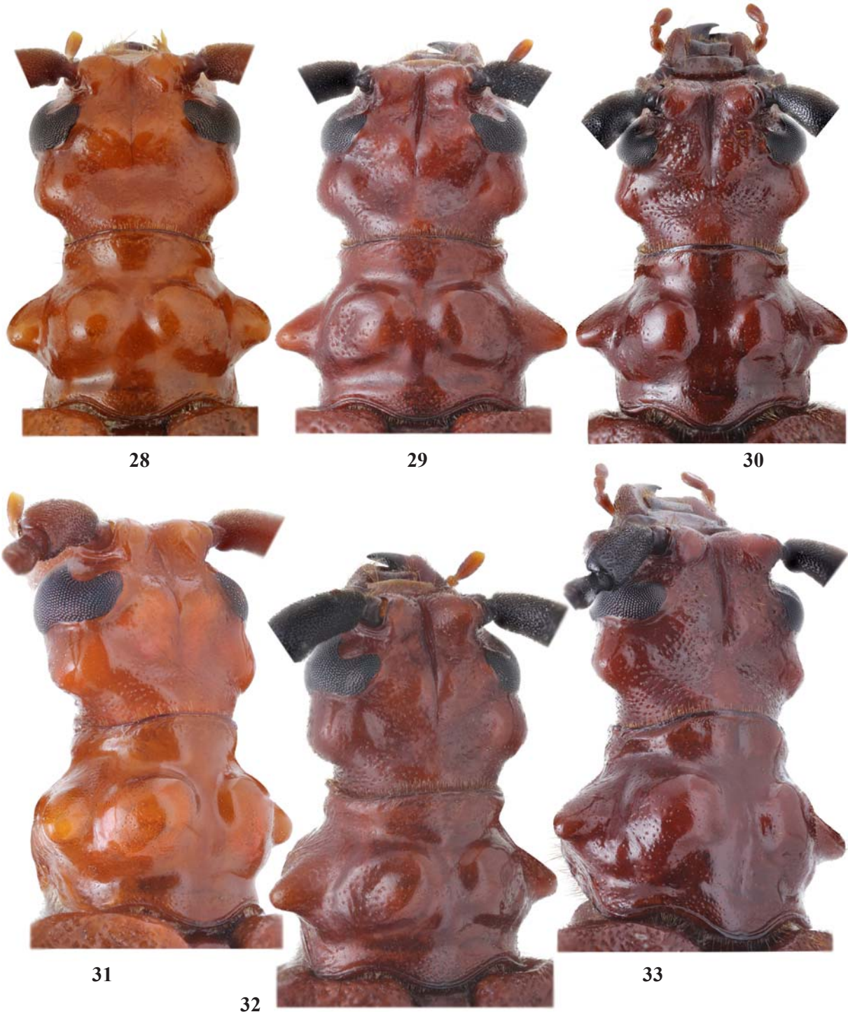
Figs 28–33. Neorhamnusium ssp., holotypes: 28, 31 — N. rugosipenne ; 29, 32 — N. shaanxiensis sp.n.; 30, 33 — N. wuchaoi sp.n.; 28–30 — head and pronotum, dorsal view; 31–33 — the same, dorsolateral view; 28–29, 31–32 — males; 30, 33 — female.

Head medium-size, at least together with prothorax not appearing small relative to elytra; with very well-developed antennal tubercles; in area of occiput strongly depressed, behind temples insensibly merging with neck; with a very sharp, deep, median groove between antennal tubercles and eyes; dorsally predominantly with a coarse or quite rough,