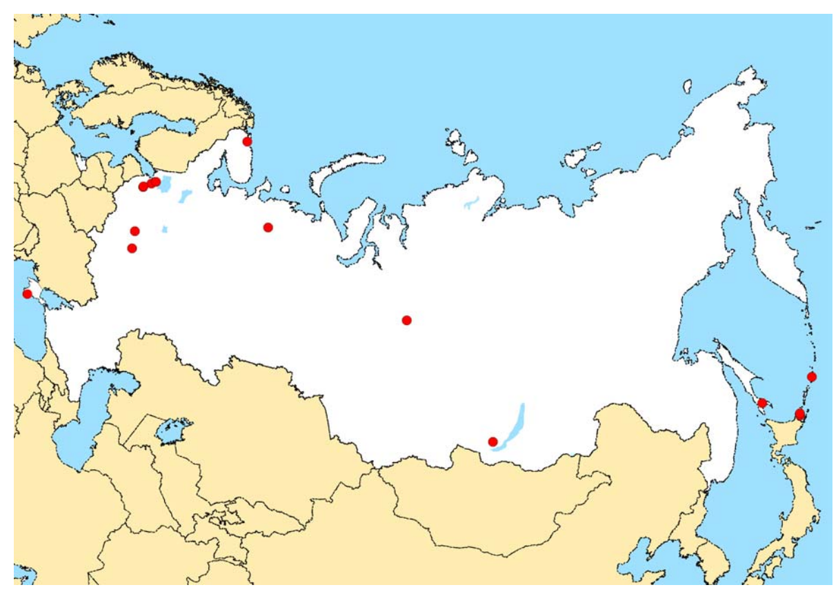
Fig. 11. Map of distribution of Euleia heraclei (Linnaeus, 1758) in Russia. Рис. 11. Карта распространения Euleia heraclei (Linnaeus, 1758) в России.

large dents (Fig. 4). Hypostomal sclerites long and sclerotized, pharyngeal sclerite with dorsal and ventral cornua anteriorly sclerotized, dorsal cornua shorter, than the ventral (Fig. 9). Anterior spiracle with small spriracular chamber, a little curved and adjoined to integument, with 15-16 spiracular openings situated in more or less regular row (Fig. 10). Thoracic segments with indistinct rows of transparent conical spines (Fig. 6). The other segments seem to be without such spines, for the rows are irregular and interrupted. Ultimate body segment with 2 types of structures: groups of large transparent elongate spines and irregular rows of small spinules (Figs 7, 8). Posterior spiracles are separate, little projecting beyond the surface, distance between them like 2-width or spiracular plate. Each spiracle with 3 spiracular openins arranged radially (Fig. 5). Spiracular hairs organized in 4 groups and poorly developed. Anal plate dark, transverse, about 2 times as wide as long, with 6 marginal dents at each side.