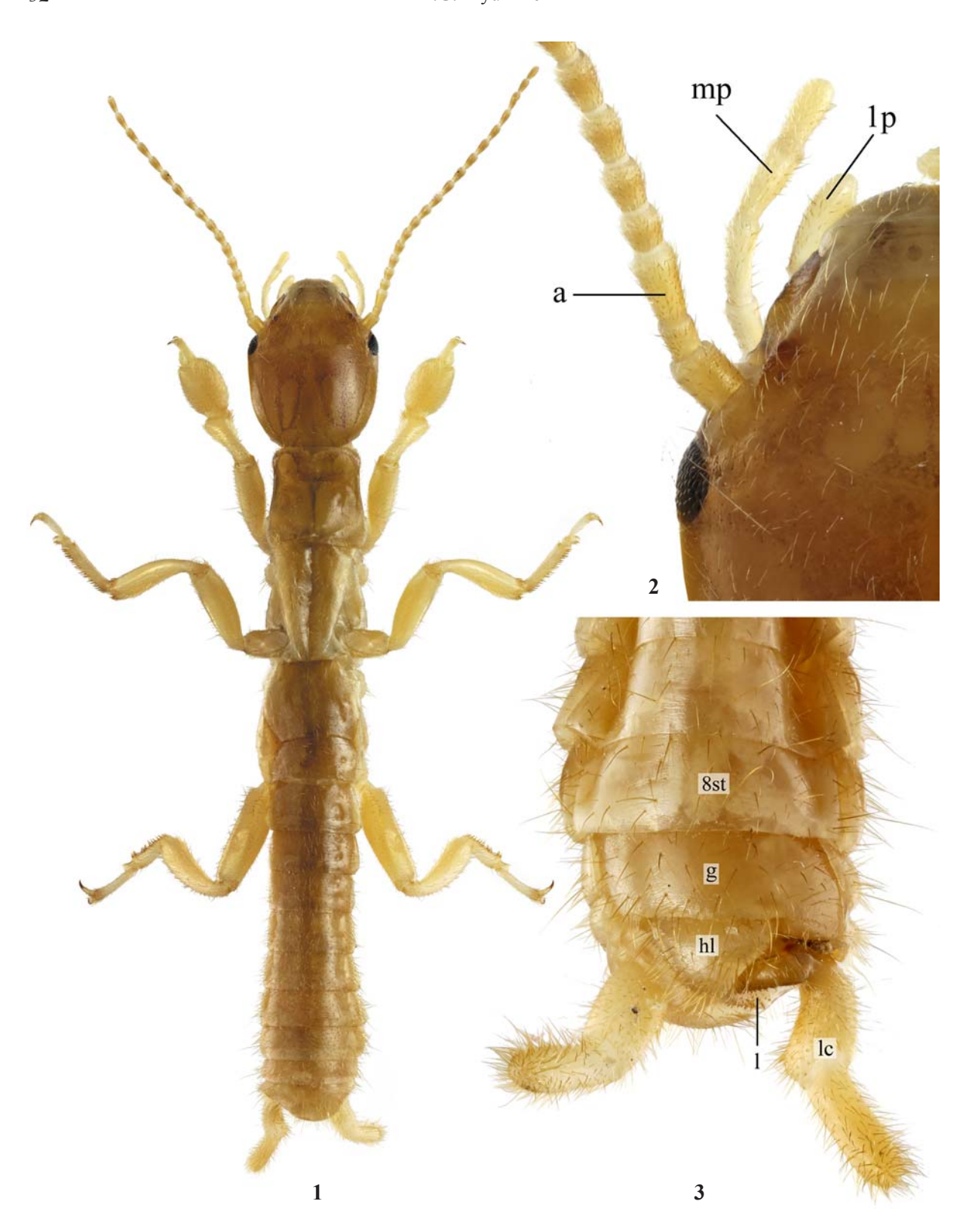
Figs 1–3. Uranembia rivkusi gen.n. , sp.n. , male. 1 — body, dorsal view; 2 — the distal part of antenna and mouth parts, dorsal view; 3 — the apical part of abdomen, ventral view; a — antenna; mp — maxillary palps; lp — labial palps; lc — left cercus; g — genital plate; ll — posterior lobe of genital plate; l — lobe of basal segment of left cercus; 8st — 8<sup>th</sup> sternite. Рис. 1–3. Uranembia rivkusi gen.n. , sp.n. , самец. 1 — тело сверху; 2 — нижняя часть усика и ротовые придатки; 3 — вершина брюшка, снизу; а — усик; mp — челюстные щупики; lp — губные щупики; lc — левый церк; g — генитальная пластинка; hl — задняя

лопасть генитальной пластинки, 1 — лопасть основного сегмента левого церка, 8 st — 8-й стернит.