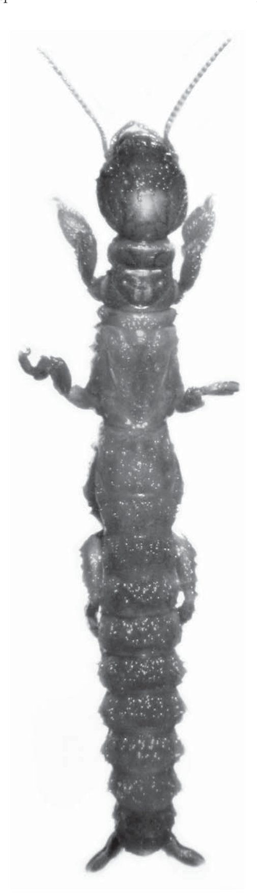
Fig. 6. Uranembia rivkusi gen.n. , sp.n. , female, dorsal view. Рис. 6. Uranembia rivkusi gen.n. , sp.n. , самка, вид сверху.

DISCUSSION. The described species demonstrates extreme adaptation to arid conditions. This is evidenced by the coloration of the integument of the imago, dwelling in sandy and loamy landscapes, a solitary lifestyle, active at night and early morning.