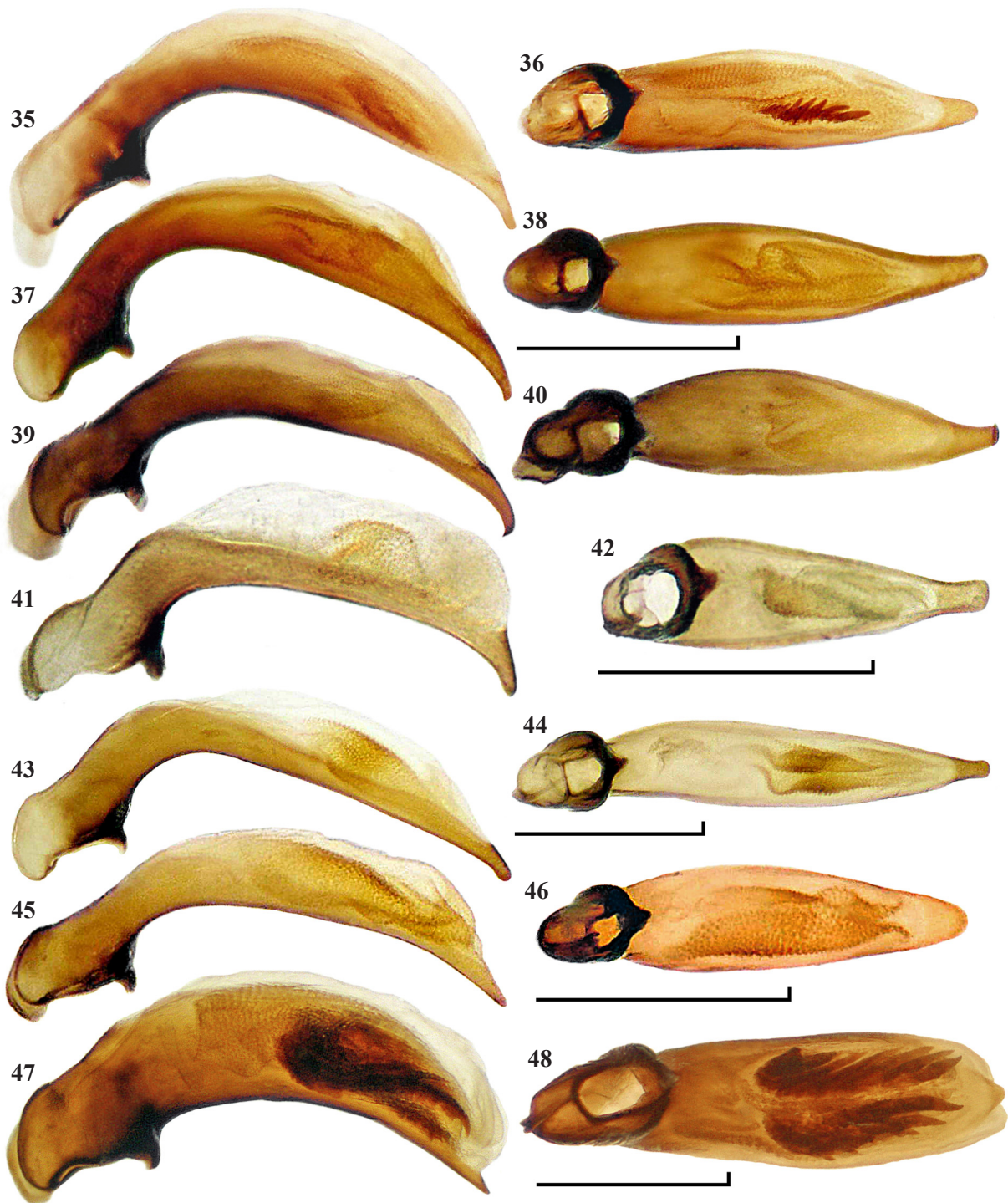
Figs 35–48. Median lobe of aedeagus: 35–36 — D. simile ; 37–38 — D. bidoupense ; 39–40 — D. rufipes sp.n.; 41–42 — D. laticolle sp.n.; 43–44 — D. blattoides ; 45–46 — D. ellipticum ; 47–48 — D. amariforme sp.n.; 35, 37, 39, 41, 43, 45, 47 — left aspect; 36, 38, 40, 42, 44, 46, 48 — right aspect. Scale bar — 1 mm.

are known from a few close localities in the Dalat Plateau, including the Dak Lak Plateau, within Lam Dong, Khanh Hoa and Dak Lak provinces, southern Vietnam. D. broteroides is endemic to the Bi Doup Mt, the Dalat Plateau.