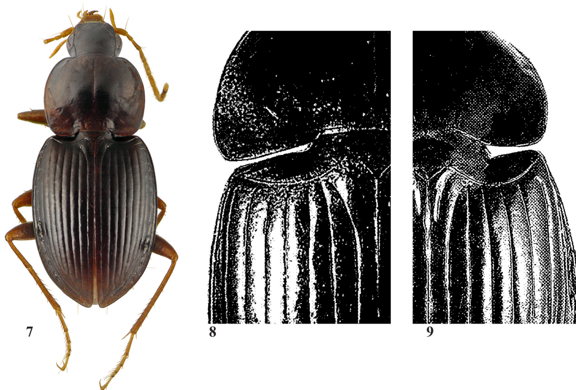
Figs 7–9. Dalatagonum : 7 — D. anichkini , holotype, dorsal habitus; 8 — D. ellipticum ; 9 — D. calathoides ; 8–9 bases of pronotum and elytra.

Legs long to (rarely) short. Pro-, meso- and metacoxa ( cx1 , cx2 , and cx3 , respectively): cx1 asetose, cx2 with two setae, inner and outer; cx3 bisetose (inner seta missing). Trochanters ( tr ): tr1 with seta; tr2 with vestigial, nearly indistinct, or (rarely) short seta; tr3 with vestigial or no seta. Femora ( fe ) ventrally flattened or shallowly grooved in apical half ( fe1 ) to nearly throughout except basally, these flats or grooves being edged or finely carinate on each side; fe1 with two posterior setae, basal and medioventral; fe3 with median anteroventral seta well-developed ( D. broteroides ) to short ( D. calathoides ) or missing (the other congeners). Tibiae ( ti ): ti1 anteriorly with a conspicuous longitudinal sulcus bearing mostly one, vestigial, preapical seta; ti2 and ti3 cruciform in cross-section due to blunt inner and outer ridges separated from sharp lateral ridges by more or less deep grooves; ti2