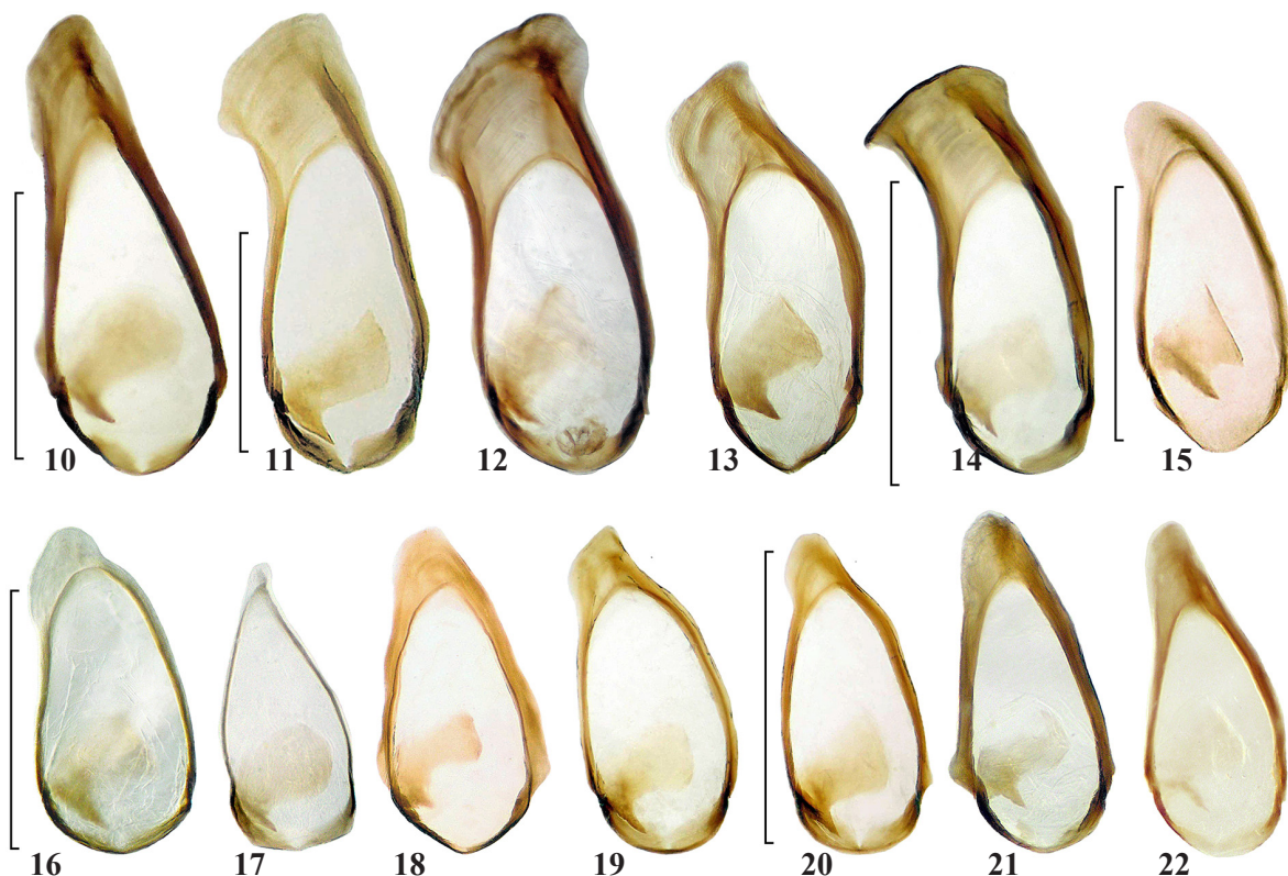
Figs 10–22. Male tergite IX, ventral aspect: 10 — Dalatagonum calathoides ; 11 — D. elongatum ; 12 — D. convexicolle sp.n.; 13 — D. amariforme sp.n.; 14 — D. ellipticum ; 15 — D. blattoides ; 16 — D. rotundatum sp.n.; 17 — D. quadrisetosum sp.n.; 18 — D. anichkini ; 19 — D. simile ; 20 — D. bidoupense ; 21 — D. rufipes sp.n.; 22 — D. laticolle sp.n. Scale bar — 1 mm.

Male T9 wide and square basally (Fig. 14). Aedeagus median lobe (Figs 45–46): apex in lateral view tapered, large, triangular, in ventral view with a widely rounded tip. Female gonocoxite IX bisetose ventrally.