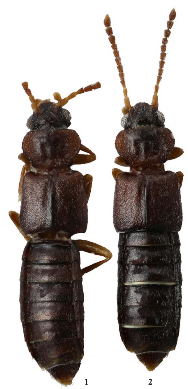
Figs 1–2. Carpelimus (s. str.) pulchrus , sp.n. , dorsal view: 1 — holotype, male; 2 — paratype, female.

COMPARATIVE REMARKS. The new species is similar in size to Carpelimus (s. str.) magnus Gildenkov, 2014 that lives in Indonesia and Philippines [Gildenkov, 2014c, 2019b], but differs from this species in having a lighter colouration, slightly more pronounced temples, wider prono-