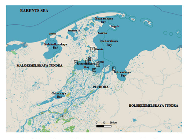
Fig. 1. Localities within the region under consideration. Рис. 1. Изученные локалитеты региона.

The quantitative surveys were carried out in the Malozemelskaya and Bolshezemelskaya tundra. On the coast of the Malozemelskaya tundra six local faunas were studied. The first two points are situated in Pechorskaya Bay: 1. Khabuika — the coast of Zakhrebet Bay, the vicinity of the village Khabuika; 2. Lovetsky — an island (41 km<sup>2</sup>) is washed by Pechora sea in the north and Korovinsky Bay in the south. The other four points are located in Korovinskaya Bay: 3. Sanev; 4. Kashin — island is not big but with a significant height difference; 5. cape Erennoy Nos; 6. Kostyanoy Nos — peninsula between Korovinskaya and Srednaya Guba. On the coast of the Bolshezemelskaya tundra only one local fauna was studied: Bolvansky Nos peninsula between the river Bolshaya Pechora and Bolvanskaya Bay (Fig. 1). The territory is situated in the