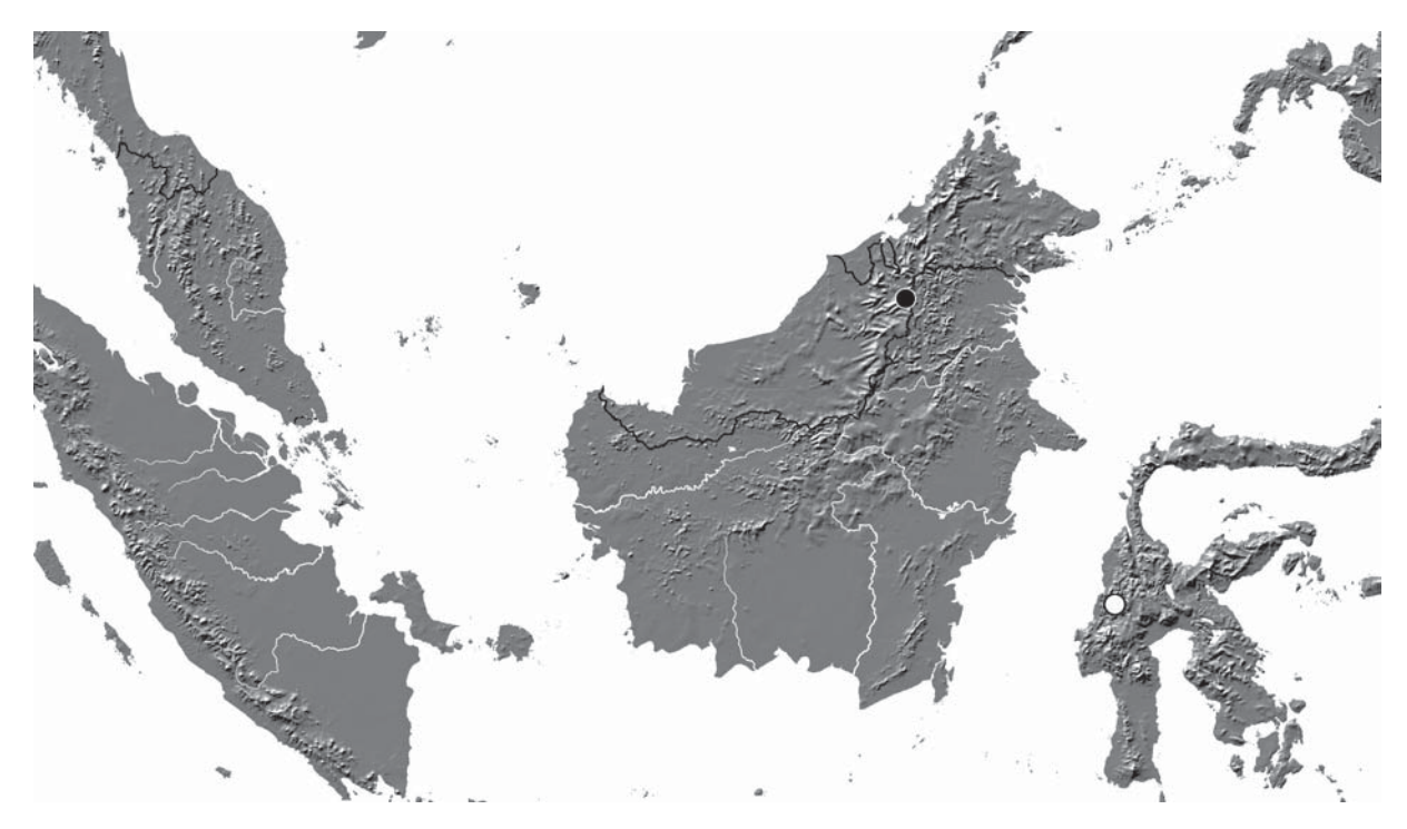
Fig. 7. Distribution of Thinodromus : T. kelabitensis , sp.n. (black circle) in Borneo and T. mamasensis , sp.n. (white circle) in Sulawesi. Рис. 7. Распространение Thinodromus : T. kelabitensis , sp.n. (черный круг) на Борнео и T. mamasensis , sp.n. (белый круг) на Сулавеси.

ETYMOLOGY. The species is named for its geographical distribution.