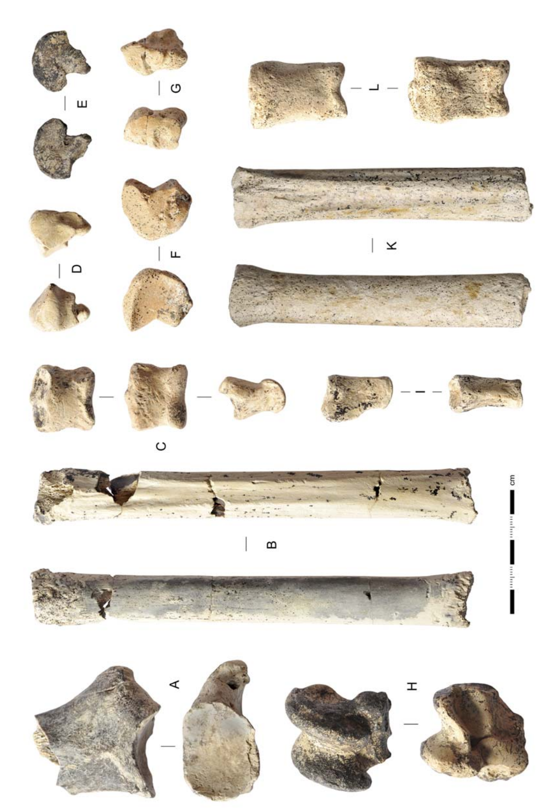
Fig. 2. Anchitherium aurelianense (Cuvier, 1825) Tagay locality, late Early Miocene, appendicular bones: A — distal fragment of scapula dex. (lateral and distal views); B — metacarpal III sin. (dorsal and plantar view); C — manual phalanx III-2 dex. (dorsal, plantar, and medial views); D — semilunare dex. (proximal and distal views); E — cuneiform III dex. (views of proximal and distal articulation facets); F — naviculare sin. (views of proximal and distal articulation facets); G — cuboid dex. (proximal and distal views); I — first phalanx of lateral digit (medial and dorsal view). K — partial MTIII dex. (dorsal and plantar views); L — pedal phalanx III-1 sin. (dorsal and plantar views).