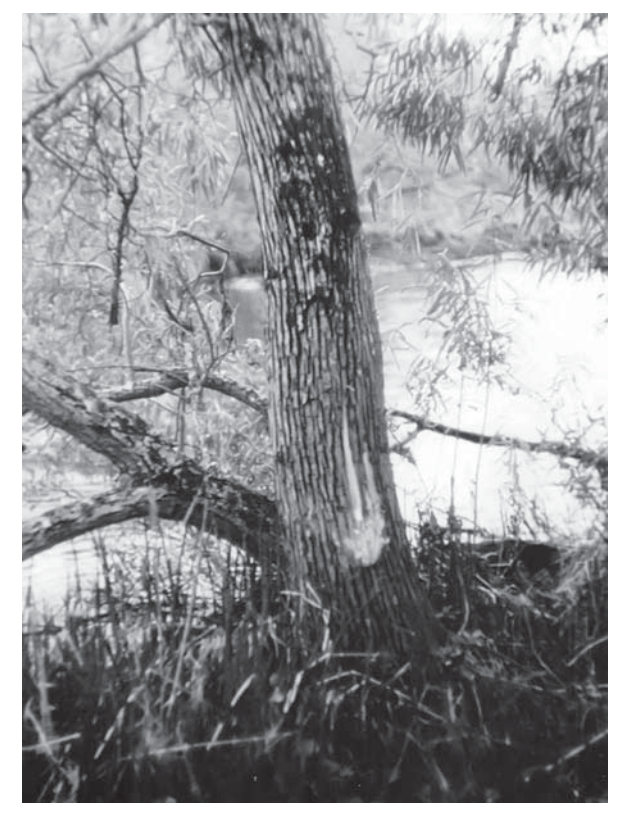
Fig. 2. Beaver cuts on a Chosenia tree.

sus arctos ) concentrate during the whole spawning season. In the first year after the release we did not find any signs of bear predation on beavers. In the consecutive years digging beaver houses and dens (Fig. 3), and bear footprints on feedlots of beavers became common. There is no data on current numbers of North American beavers in Kamchatka and their relations with bears. The study of the interspecific peculiarities of behaviour of beavers in the contact areas and their relations with local fauna, needs to be done (Oleynikov, 2013).