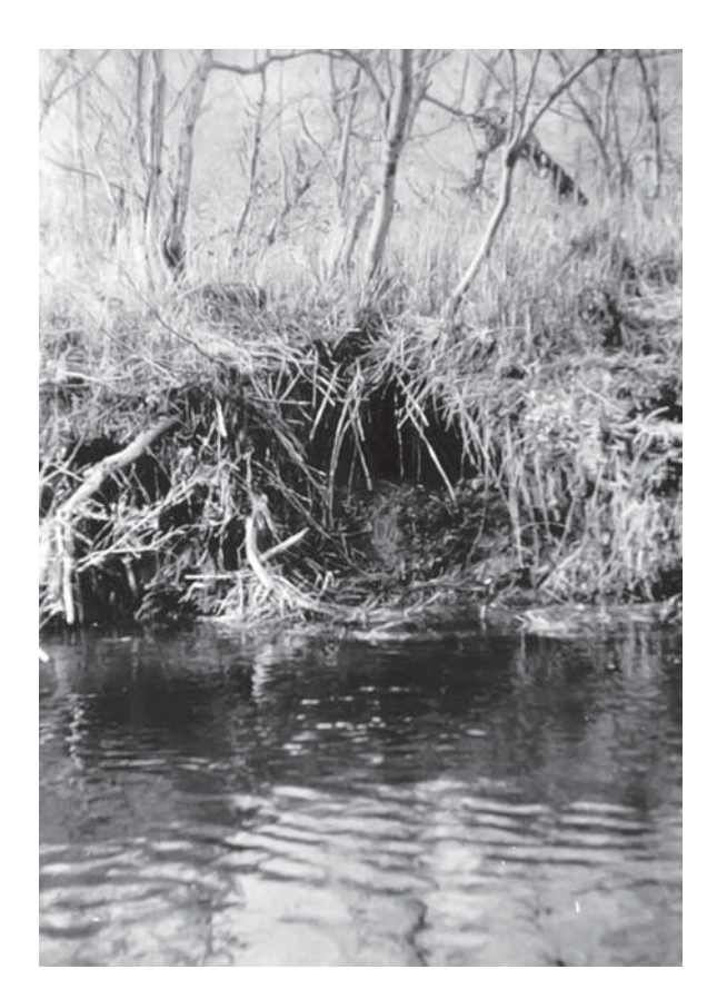
Fig. 3. Lodge of introduced beaver has been dug out by a brown bear.

nikov & Saveljev (2001), and Saveljev (2003). Because low genetic diversity (bottleneck effect) can be a cause of a stable depressed population state, it is more rational to try to manage the process on the basis of special studies than to take almost impossible to enforce measures of protecting isolation during natural resettlement.